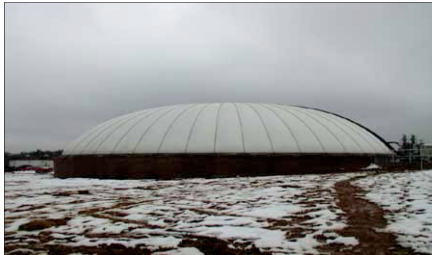
Anaerobic Digester at the Water Reclamation Facility