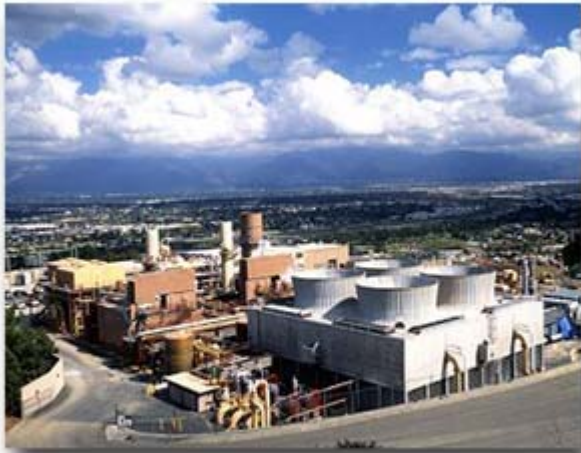
Puente Hills Landfill Gas-to-Energy Facility produces close to 50 megawatts of electricity.